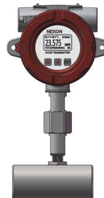
BT Explosion-proof digital display type BT1001 BT1002