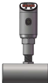
DWE Digital display DW1001 DW1002 DW1003