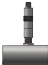
Pulse output type RS1000 VS1000